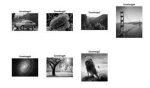
Fig2: Original Cover Image Taken

Fig1: Original Data Images & Image reconstructed after compression